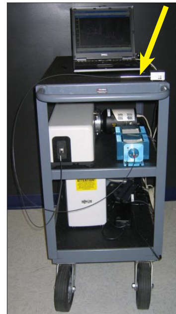
b) Photo of system on cart, ready for use in the clinic. Note the yellow arrow pointing to the probe.